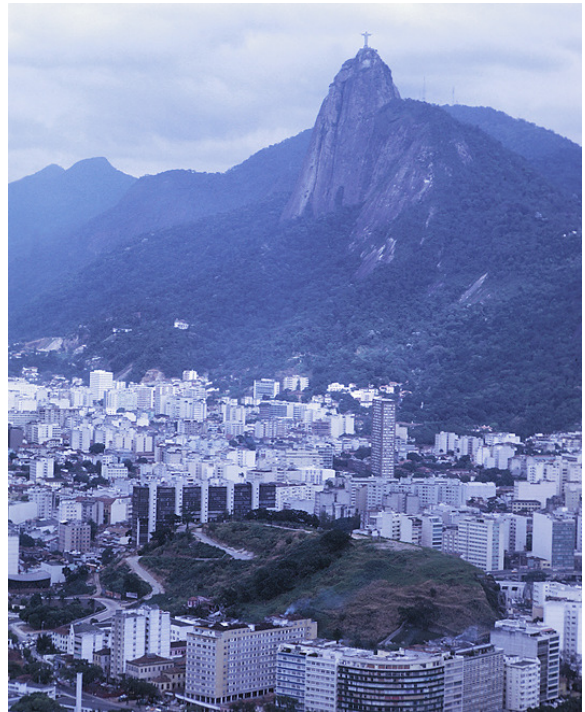
Rio de Janeiro