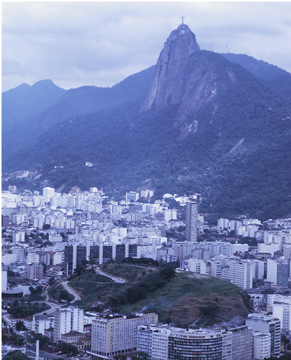
Rio de Janeiro