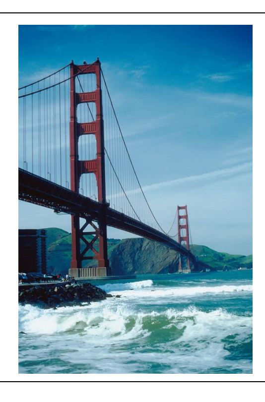
Golden Gate Bridge