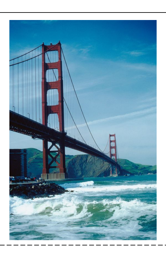
Golden Gate Bridge