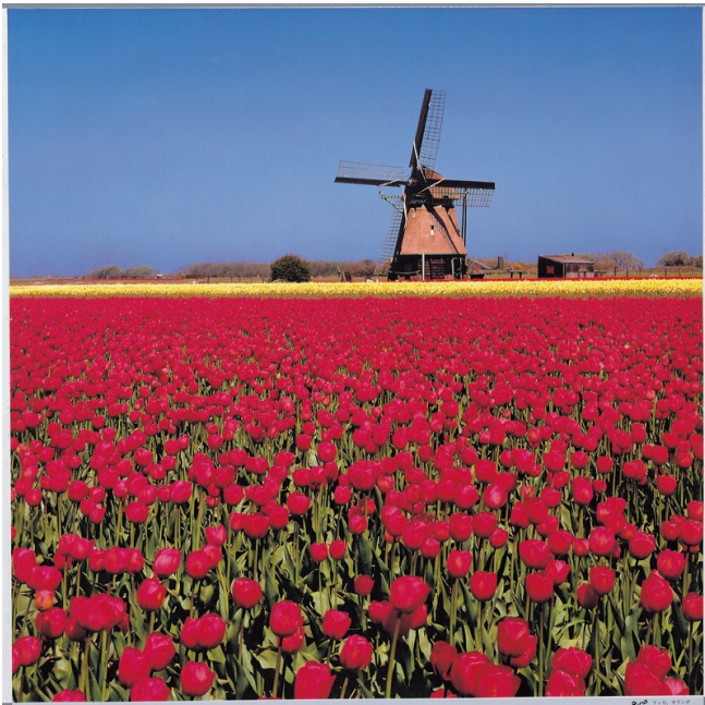
Tulips and Windmill