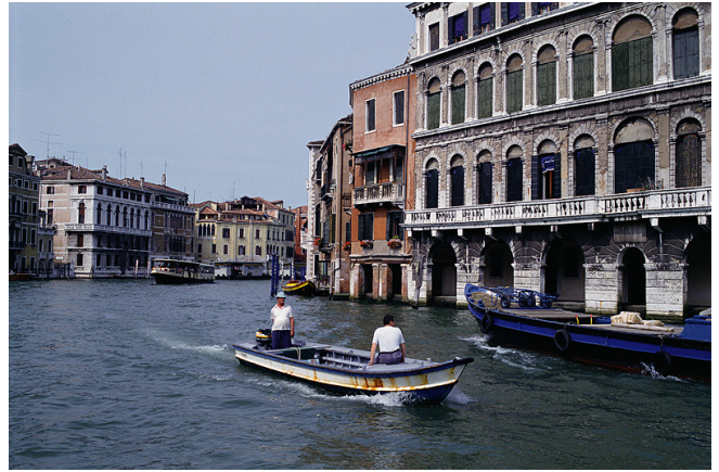
Canal in Venice