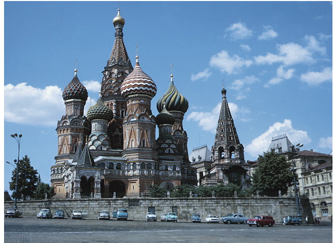
St. Basil's Cathedral