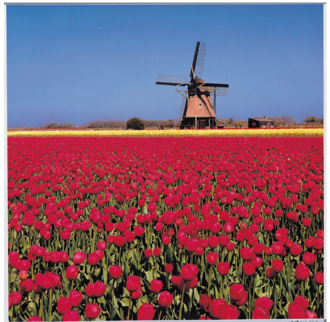
Tulips and Windmill