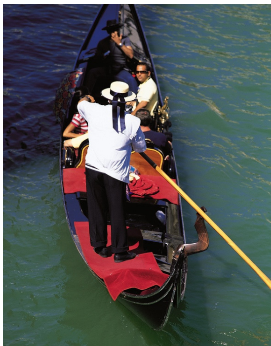
Gondolas in Venice