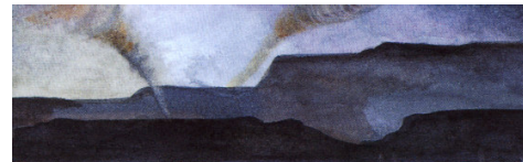
9. Plateau or flat area of land.