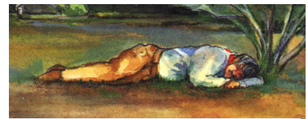
10. Afternoon nap