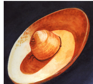
6. Hat worn by vaqueros