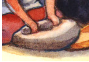
1. A flat stone upon which corn and other grain may be ground