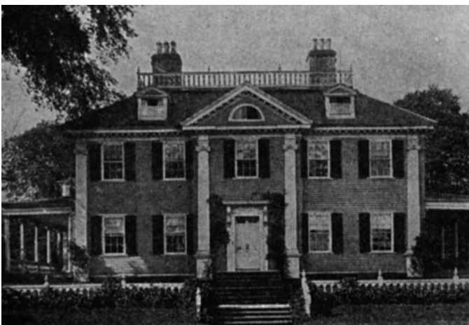
The Longfellow House

In the world's broad field of battle, In the bivouac of Life, Be not like dumb, driven cattle ! Be a hero in the strife !