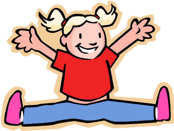
fidget to move restlessly