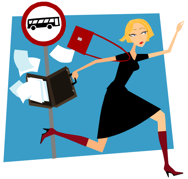
scuttled to move quickly